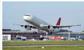
A major airline just slashed fares to 60+ cities across the U.S. Travel is valid into January 2010 with this deal. As seen on TRAVELZOO

UniData will show its top-notch products and contact people in related companies and industries in the international exhibition, which is referred to as the "Telecommunications Olympics" and recognized as a place where enterprises and organizations from around the world would compete with one another to show their technological development achievements. This time, the company's prime aim is to find new competitive partners and distributors over the world to show its advanced technologies and new products and conducting effective marketing strategies.